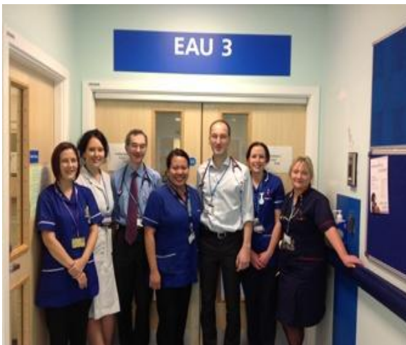
Ambulatory Care Team