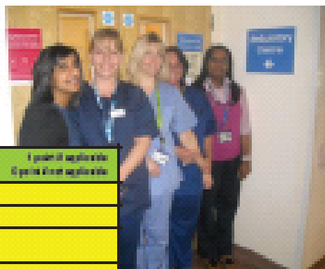
The AMB score